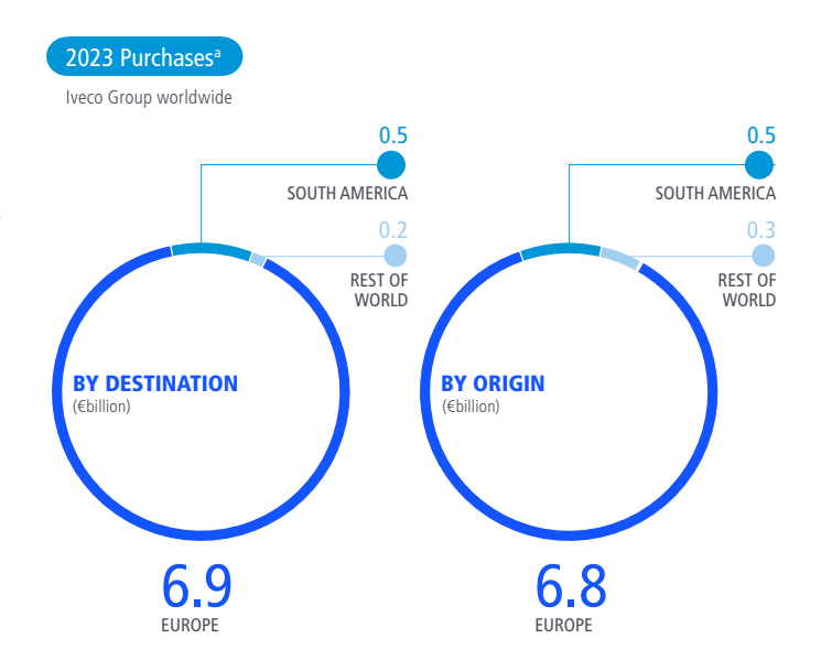
(a) Refers to the value of direct material purchases.

The targets we have set ourselves include developing local skills, transferring our technical and managerial expertise and strengthening local businesses. We strive to build strong long-term relationships with local suppliers as this leads to fewer risks associated with business operations and optimises costs. Significant amounts are spent with local suppliers<sup>4</sup>: in 2023, the contracts signed with them accounted for 97% of Iveco Group's procurement costs. Furthermore, 97% of these contracts were signed in Europe, our primary location of operation<sup>5</sup>.